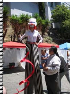
Wow! Girls on stilts! This lady was in constant motion!