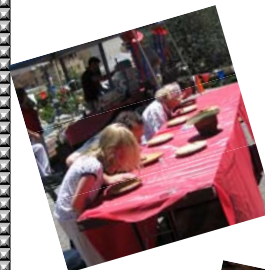
Yummy pie eating contest